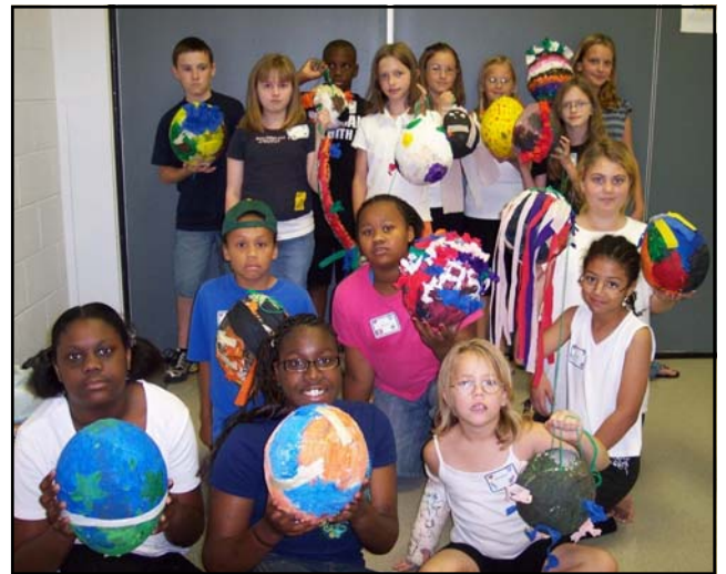
Kids' College participants got in a full week of fun and learning at ASU-Newport's Kids' College last month. This year's theme for Kids' College was "A World of Wonder."