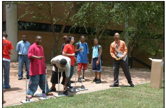
Students from Pulaski County High School prepare their rockets for lift-off during the recent two-week Aerospace Academy, sponsored by Central Arkansas Aerospace Alliance and held on the grounds of UALR.