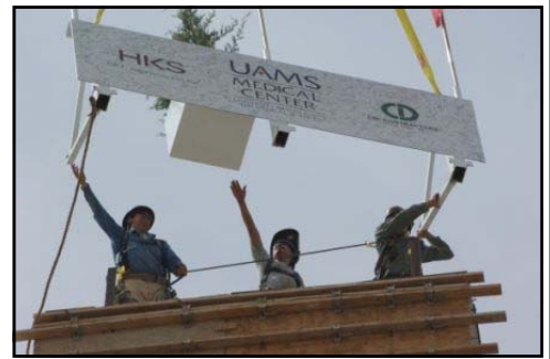
Construction workers at UAMS raise a steel beam into place in a "topping out" ceremony marking the highest point of construction of the 540,000 square foot expansion of the UAMS Medical Center.